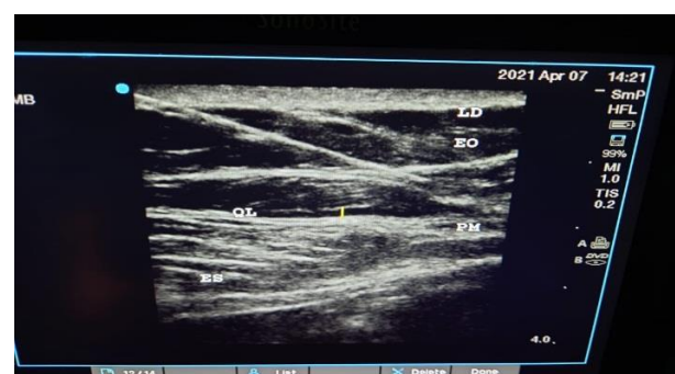
Figure 2: Quadratus lumborum block.