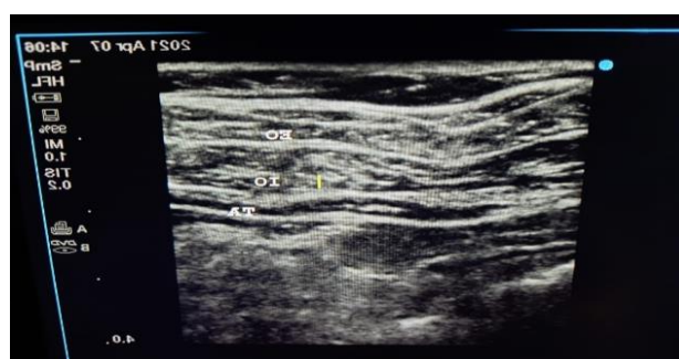
Figure 1: Transversus abdominis plane block.

(Sonosite Edge II, Fujifilm Sonosite Inc) range was placed on the anterolateral abdominal wall, just cephalad to the iliac crest level where the 3 muscle layers (external oblique, internal oblique and transversus abdominis) are identified as a distinct layer (Figure 1). After identification of transversus abdominis neurofascial plane between the internal oblique muscle and transversus abdominis muscle, the USG probe was moved posterolaterally to lie between the costal margin and iliac crest across the mid axillary line. The appropriate depth and gain of the probe were adjusted to optimize the image of the abdominal wall muscles and the underlying peritoneal cavity. The target was the fascial plane between the internal oblique and the transversus abdominis muscle approximately in the mid axillary line. Approximately between 40 and 50 ml of the total drug volume for the block (as per patient weight) in appropriate dilution was deposited in the transversus abdominis plane under ultrasound guidance on both the sides.