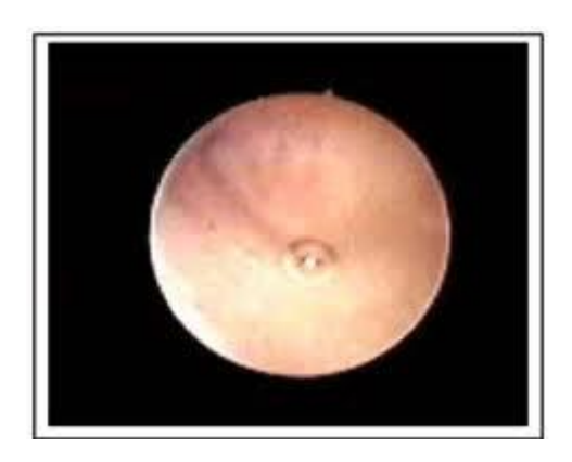
Figure 1: Simple hyperplasia without atypia.