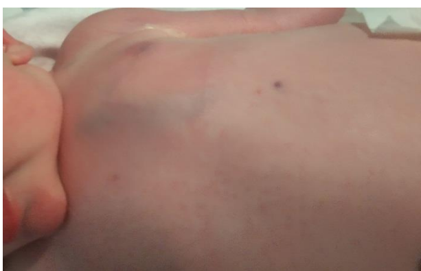
Figure 3: Petechiae and haemorrhagic suffusions – case 2.

By the second day of life, platelet count rose to 58 \times 10^9/l , however, in the following 2 days, a sharp drop was found, reaching 9 \times 10^9/l by the ninth day of life. After the eleventh day of life, platelet count was always higher than 50 \times 10^9/l . The newborn was discharged home by the fourteenth day after birth with a platelet count 191 \times 10^9/l and there was no further progression of petechiae and haemorrhagic suffusions. The newborn has been on exclusive enteral feeding with autonomy since birth and had an unremarkable neurologic examination.