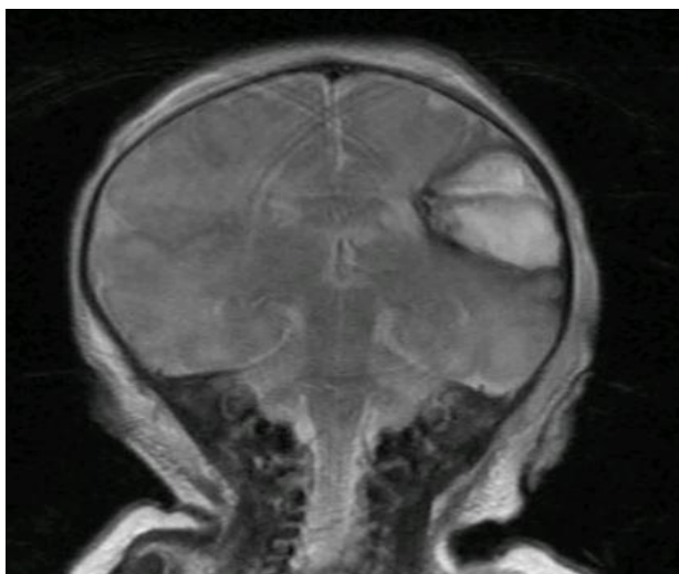
Figure 1: A coronal view of the brain magnetic resonance imaging – case 1 – showing blood in the frontoparietal intra axial space of the middle left cerebral convexity.

The cranial ultrasound showed a parenchymatous hyperechoic lesion, of triangular shape, on the left frontoparietal region, close to the ventricle. A cranioencephalic magnetic resonance was performed revealing the presence of blood in the frontoparietal intra axial space of the middle left cerebral convexity, findings compatible with a haemorrhagic stroke (Figure 1 and 2).