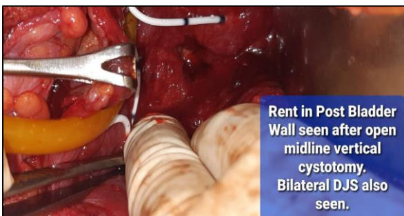
Figure 2: Rent in post bladder wall seen after open midline vertical cystostomy.

Apart from routine blood and urine investigations, non-contrast CT KUB was advised which revealed a hyperdense foreign body, located in the right anterolateral aspect of the vagina (Figure 3). The Foley bulb was identified in the collapsed bladder and without there was no fluid or hematoma in the pelvic cavity. As there were no complaints of a urinary leak or supra pubic pain or tenderness at any point in time, we were not expecting any bladder injury. So patient was planned for diagnostic cystoscopy and exploration under anesthesia.