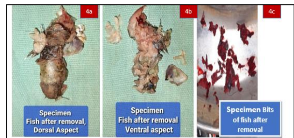
Figure 4: (a) Specimen Fish after removal, dorsal aspect, (b) specimen Fish after removal ventral aspect, (c) specimen bits of fish after removal.

The rest of the cystoscopic findings were normal. With the help of Sims speculum in the vagina, laceration of size 2×1 cm was noted in the right anterolateral fornix at 10 – 11 o'clock position, through which fish remnants could be palpated. With the help of ovum forceps and finger guidance, the same was removed which was found to be the head and body of fish of size approximately 8×3 cm (Figure 4a, 4b, 4c). Vaginoscopy was done with a cystoscope and the remaining bits of fish were removed with the help of cystoscopic grasper under vision. Complete removal of fish was confirmed by repeat Cystoscopy, which did not show any fish remnants, and only the laceration in the posterior wall of the bladder was seen.