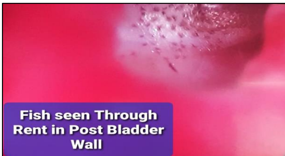
Figure 1: Diagnostic cystoscopy.

any history of sexual assault or gratification practice. There was no complaint of difficulty in passing urine, straining, dribbling of urine, and urinary leak per vaginam. She had no lower abdominal pain or distention of the abdomen or passage of blood or clot in urine. On examination, her vitals were stable. The abdomen was soft, non-tender, non-distended, and normal bowel sounds were present. On local examination, an 18 Fr Foley catheter was draining mild blood-stained urine. On P/V examination, a laceration of size 2×1 cm was noted in the right anterolateral fornix at 10-11 o'clock position, through which the remnants of the fish could be palpated with the finger.