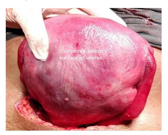
Figure 1: Unscarred uterus with intact anterior surface.

monitoring. After 30 mins of starting oxytocin patient complained of severe pain abdomen and on CTG fetal heart dropped to 70 bpm. Oxytocin infusion was stopped, patient was kept in left lateral position, oxygen supplementation was started and intravenous fluid was rushed but fetal bradycardia persisted. Patient was immediately shifted to operation theater for cesarean section in view of non-reassuring fetal status. Intra operatively, there was hemoperitoneum of about 1 liter and fetus with placenta were lying in the peritoneal cavity. There was uterine rupture on posterior surface of uterus extending from left cornua to lower part of uterus till uterosacral ligament. Uterine rupture was repaired in 2 layers, bilateral uterine arteries were ligated, hemostasis was achieved and two units of whole blood were transfused. Her postoperative period was uneventful and she was discharged on 5<sup>th</sup> day. Baby's birth weight was 2800 gm Apgar score of 0, 3, 5 and died on third day after a stormy course in NICU.