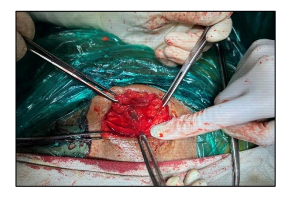
Figure 1: Chocolate like material seen in the layers of subcutaneous tissue.

MRI pelvis was done which showed the presence of 5\times 8 mm size T1 hyperintense, T2 hypointense peripherally enhancing nodular lesion in the subcutaneous plane in the hypogastrium on the right side which was abutting the rectus sheath. Differential diagnosis of scar endometriosis and stitch granuloma was made at this point.