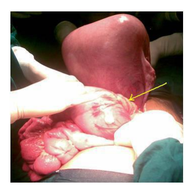
Figure 1: Per-op finding of case report 1, dilated large intestine with volvulus of sigmoid colon.

21 year old, primigravida with 21 weeks of pregnancy presented to our hospital with complaints of severe abdominal pain, vomiting and constipation for six days. She was treated in a local hospital conservatively, failing which she was referred to our hospital. On examination she had tachycardia, normal blood pressure and signs of dehydration. Her abdominal examination showed tenderness, guarding and fullness in the right hypochondrium. Uterus size corresponded to 20 weeks gestation with a live fetus. X ray and ultrasound was carried out and surgery team was contacted for opinion. USG showed an air filled dilated cecum in right iliac fossa, and prominent small bowel loops with a probable diagnosis of volvulus. Emergency laparotomy was planned. The findings were ileo-caecal intussusception, with impending perforation of cecum. The omentum was attached to perforation site. The procedure carried out was limited resection of right colon. About 8cm of ileum with cecum and middle 1/3^{rd} of ascending colon was resected with end to side anastomosis between ileum and ascending colon. Patient recovered completely in the post operative period and fetal condition was also stable. Histopathology report showed ileocecal intussusception with lymphoid hyperplasia of ileum.