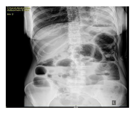
Figure 2: X-ray image of case report 2, showing multiple fluid levels with gas above; 'step ladder pattern', suggestive of bowel obstruction.