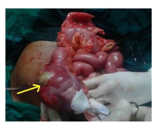
Figure 5: Per-op finding of case report 3, showing ileo-caecal intussusception, with impending perforation of caecum.