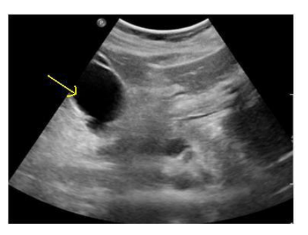
Figure 4: Ultrasound image of case report 3, showing dilated caecum.