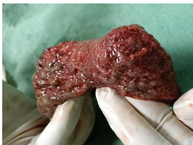
Figure 2: Uterine cavity opened uterus specimen.

Bowel gangrene of 20 cm noted, 100 cm from ileocecal junction. No bowel or other visceral perforation was found. A perforation was identified at the uterine fundus of about 5 mm, with surrounding necrotic and friable tissue. The uterus was non-gravid and atrophic. No foreign body was noted. Considering the patient's postmenopausal