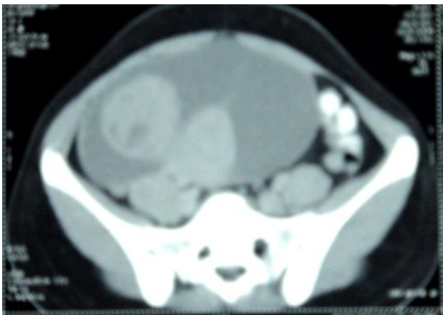
Figure 1: CT image of abdominopelvic mass.

Hence, causes for secondary amenorrhea and virilization other than ovarian tumor like pregnancy; PCOS, thyroid disorder, hyperprolactinemia, adrenal tumors and late onset adrenal hyperplasia were ruled out. In presence of rapid onset virilization, complex ovarian mass with high testosterone levels, presence of a virilizing ovarian tumor was suspected. Exploratory laparotomy was performed. Intraoperatively, a large 20x25 cm, smooth, lobulated, solid mass arising from right ovary with intact capsule was noted (Shown in Figure 2 and 3). Uterus, left fallopian tube and left ovary were macroscopically normal. There was no evidence of metastasis to other pelvic structures, omentum, peritoneum, lymph nodes or other intra-abdominal organs.