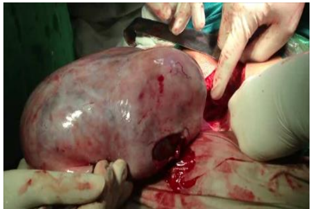
Figure 2: Gross appearance of ovarian tumor.