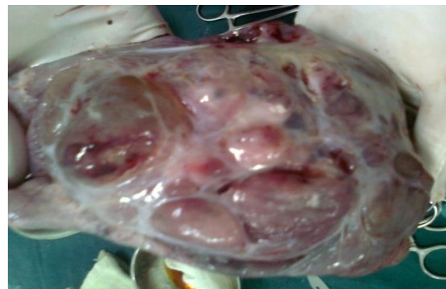
Figure 3: Cut section of ovarian tumor.

As per surgical staging (stage I) and need for fertility preservation, unilateral salpingo-oophorectomy was done. Histopathological examination was found to be consistent with diagnosis of Granulosa cell tumor ovary with characteristic “Call Exner’s” bodies with coffee bean nuclei with fibrothecomatous areas (Shown in Figure 4).