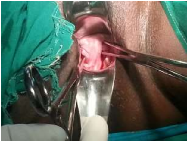
Figure 1: Speculum examination: two cervixes held with volsellum with cut longitudinal vaginal septum in between.