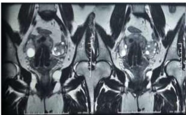
Figure 3: MRI: Single fundus with two uterine cavities and two cervical canals.

On hysterosalpingogram, two noncommunicating uterine cavities with double cervix were seen with bilateral free spillage of fallopian tubes (Figure 2).