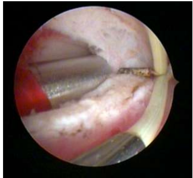
Figure 4: Hysteroscopic septum resection with metal dilator in other cavity.

On MRI, a single fundus was found, two separate uterine cavities with complete uterine septum, continuous with complete cervical septum, leading to double cervix, with no abnormalities in the urinary tract (Figure 3).