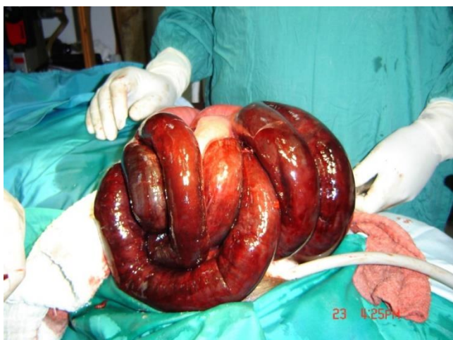
Figure 2: Extensive gangrene of the ILEAL loops outside the abdomen.

Extensive gangrene of the ILEAL loops outside the abdomen Figure 2. The ileum was found twisted around a band at the ileocaecal area. Resection of the gangrenous segment and a right hemicolectomy was performed. The manipulations were done carefully; the gravid uterus was not manipulated. Ileo-transverse anastomosis was carried out. The closure was done in layers. Postoperatively Analgesia was given, and antibiotics were continued. The postoperative course was uneventful. The patient was discharged home after seven days in good condition. The patient completed her pregnancy and delivered at term vaginally normal delivery without any complication.