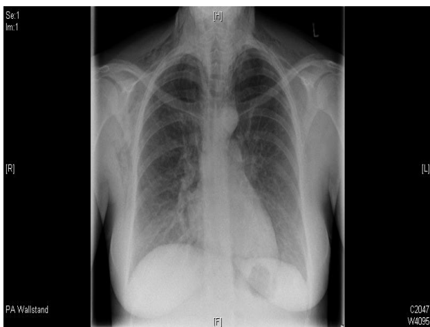
Figure 2: AP chest X-ray 17 hours postpartum.

She was noticed to have significant facial oedema and her face looked flushed as if she had an allergy reaction a few minutes just before her delivery. She had mild breathing discomfort but she was not tachypnoeic. Respiratory rate was 18 breaths/minute. There was no associated chest pain, palpitation, sweats or nausea. On examination, she was comfortable. Haemodynamically, she was stable. She was neither pale nor cyanosed. Her oxygen saturation was 99% on air. Crepitus was felt in her cheek, neck and anterior chest wall. There was no tracheal deviation and the air entry was equal bilaterally. She was transferred to High Dependency Unit (HDU) on labour ward. An electrocardiogram (ECG) showed sinus tachycardia with no acute ECG changes. Chest x-ray revealed gross and extensive surgical emphysema across the chest and up into the neck and with no evidence of pneumothorax