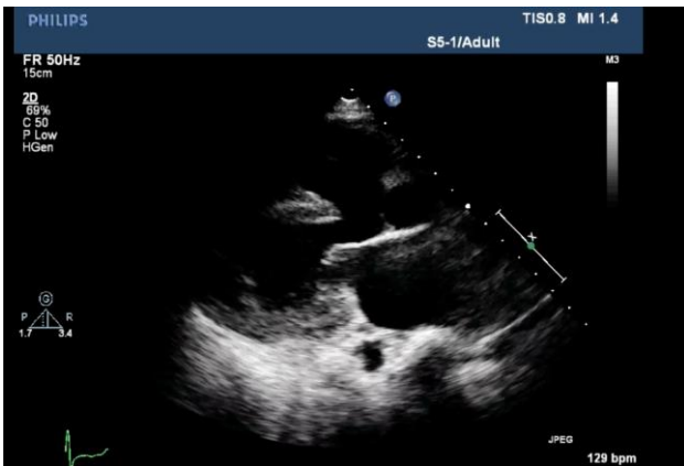
Figure 1: Two-dimensional echocardiogram showing large sub aortic ventricular septal defect with overriding of aorta and right ventricular hypertrophy.

Echocardiogram (Figure 1) showed levocardia and hypertrophy of inter ventricular septum and right ventricle, large VSD, bidirectional shunt, overriding aorta >50%, severe. Pulmonary stenosis, fair PA size, left aortic arch, no coarctation of the aorta, no collateral from descendent aorta with LV ejection fraction 60% finding consisting with Tetralogy of Fallot.