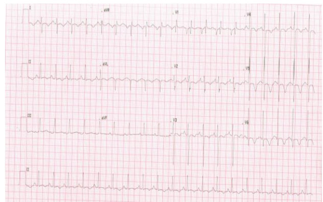
Figure 2: ECG showing sinus tachycardia, right QRS axis deviation 90, left atrial enlargement with normal PR interval, incomplete right bundle branch block, and T wave inversion in lead I, aVL, V2 to V6.

She lost follow up and came after 1 month with dyspnoea NYHA class III, investigations showed hemoglobin 13.5g/dL, hematocrit 60.8%, WBC 6200/cc, platelet count 2.80,000/cc. Arterial blood gas analysis showed pH: 7.307, pCO2: 24.3 mmHg, pO2: 50.6 mmHg, saturation of O2: 87%, HCO3-: 12.6 mEq/l; showing uncompensated metabolic acidosis, urine analysis, and serum electrolytes were within normal limit. She was afebrile, her pulse rate was 128/minute, blood pressure 100/70 mm of mercury, respiratory rate 28/minute, bilaterally symmetric chest movement with crepitation on right lower zone, and baseline cyanosis. On auscultation S1 was normal, single S2, gallop rhythm and ejection systolic murmur over pulmonary area.