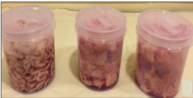
Figure 6: Morcellated pieces of myoma weighing 9.4 kg.

The procedure was completed in 4 hours with a blood loss of 700 ml. The weight of the specimen was 9.4 kg. Despite the difficulties faced there was no major intraoperative complications. Postoperative period was