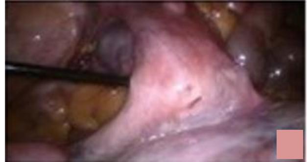
Figure 3: Uterine attachment of the myoma.

can be visualized properly. Intra-operative findings revealed an exceptionally large myoma arising from uterine fundus and filling the entire abdomen (Figure 2). Manipulation of myoma and visualization of its attachment to uterus was a big challenge (Figure 3).