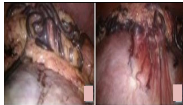
Figure 4: Large serpentine feeding vessels from omentum providing blood supply to the giant parasitic myoma

Another big challenge was large multiple feeding vessels coming from omentum which were the main source of blood supply to this giant parasitic myoma. The uterine attachment (about 5 cm pedicle), bilateral adnexa and other pelvic organs were visualized. Dilute vasopressin (20 units in 200 ml normal saline) was injected into the myometrium at the uterine attachment of myoma. The myoma was separated from the uterus using harmonic scalpel (Ethicon Endo-Surgery Inc, Cincinnati, OH, USA) and traction by myoma screw along with counter traction on the uterus. Myoma base was sutured using 1-0 V-loc unidirectional barbed suture (Covidien, UK). The challenge we faced while operating was the large serpentine feeding vessels (5-10 mm in diameter) from the omentum (Figure 4). These feeders were coagulated with bipolar coagulation and cut with harmonic scalpel.