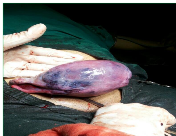
Figure 3: Case of abruptio placenta.

Patient referred with a referral slip- diagnosed as a case of abruptio placentae + IUD + previous LSCS. Her gestational age was 37 weeks. Patient was a known case of pre-eclampsia and was on anti-hypertensive Labetalol 100mg bid. On admission- blood tinged urine was present. Membranes were absent, and bleeding was present per-vaginally. The patient was in a state of shock. On ultrasonography- a retroplacental clot of size 5*6 cm was confirmed with fetal demise. Emergency LSCS was planned for obstructed labour. Intra operatively- corvilinear uterus with multiple hemorrhagic spots was found. 2 units PCV and FFP was given. Patient was stable post operatively.