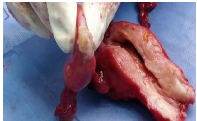
Figure 4: Post-operative cut section showing the normal endometrial cavity and right pyosalpinx.