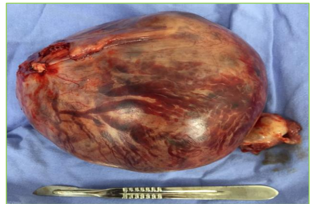
Figure 2: Product of ectopic pregnancy of 19.6 weeks of gestation prior to its dissection.

Upon admission, it presents with facial facies, agitation, pallor of teguments, tachypnea and orthopnea, dehydration data. At the abdominal level, with a globose abdomen at the expense of adipose panniculus, muscular resistance, superficial and deep palpation pain, negative decompression, uterus with normal tone and without activity; Fetal heart rate of 135 beats per minute; vaginal touch with posterior cervix, closed and without corroborated transvaginal losses.