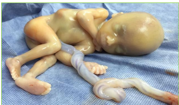
Figure 4: Product of ectopic pregnancy of 19.6 weeks of gestation.

The simple abdominal radiograph shows compatible data with presence of abundant fecal matter and distension of bowel loops. Abdominal ultrasound reports right subphrenic free fluid, findings suggestive of functional colonic disorders and surgical absence of gallbladder. In the obstetric ultrasound is determined: pregnant uterus with unique product, live and intrauterine, well formed, in a non-definitive variable situation, with active body movements, preserved fetal attitude, with a heart rate of 140 beats per minute, encephalon and neural axis without alterations, high posterior body placenta without evidence of bruising or detachment, amniotic fluid of normal volume for gestational age, average fetometry of 19.6 weeks of gestation. Intramural myoma is identified in the anterior wall of the cervical segment measuring 5.2 x 4.5 x 7.2 cm 3 , urinary bladder with urinary sediment. Additionally, a giant subcapsular hematoma at the hepatic level is revealed by simple abdominal tomography.