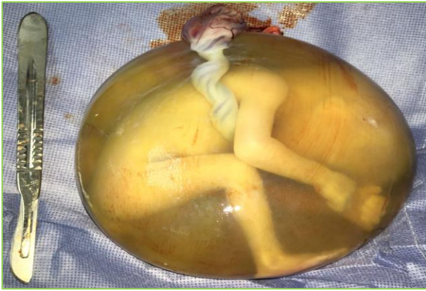
Figure 3: Product of ectopic pregnancy of 19.6 weeks of gestation inside fetal membranes.

hemoglobin of 8.3 g/dL), leukocytosis at the expense of Neutrophilia (33.9 x 10 3 ), neutrophils 83%), compensated metabolic acidosis (pH 7.3, partial pressure CO 2 31 mmHg, sodium bicarbonate 15.3 mmHg).