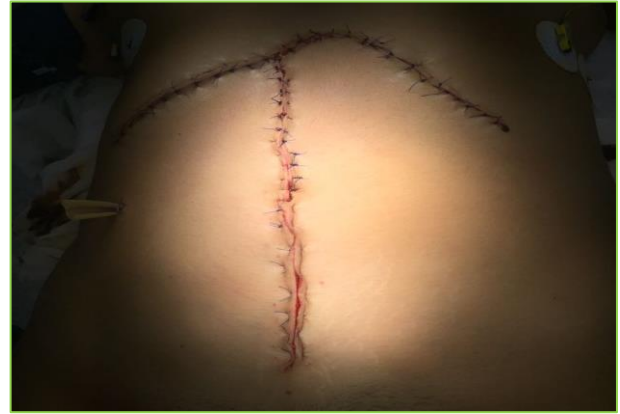
Figure 5: Surgical incisions performed for diagnostic abdominal cavity exploration.

subcostal incision (Chevron) and a second midline incision. A ruptured right tubal ectopic pregnancy requiring right salpingo-oophorectomy is observed. Male newborn of 300 grams is obtained, with intact fetal membranes. It is estimated that 1500 cc. A second exploratory laparotomy is performed secondary to the presence of blood content in Penrose drainage. Hemostasis of bleeding pedicle is ensured.