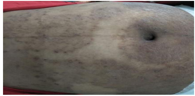
Figure 9: Taenia and scabies dual infection.

present study of 1256 cases, 109 (8.67%) had specific dermatoses of pregnancy.