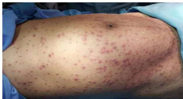
Figure 6: Impetigo herpetiformis

Impetigo herpetiformis is a form of pustular psoriasis; it is a rare skin disorder occurring in the second half of pregnancy.