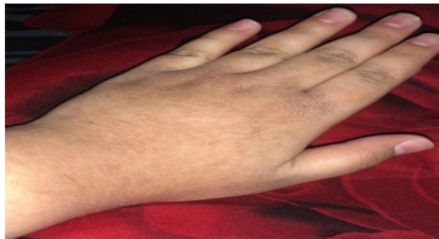
Figure 1: Eczema exacerbated in pregnancy.

Occur mostly in the first and second trimester, including all parts of the body. In Pregnancy there is suppression of maternal cell-mediated immunity and increased humoral immune response to prevent fetal rejection. 5 This leads to the exacerbation of atopic dermatitis. The patients have high serum IgE levels. Eruptions are seen more commonly in primigravida with single foetus.