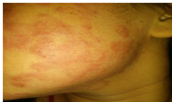
Figure 2: Another instance of eczema exacerbated in pregnancy.