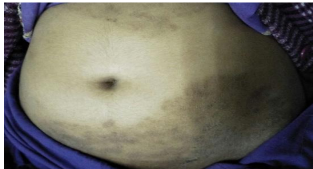
Figure 5: Pemphigoid gestationis.

placental failure that may cause premature deliveries and small for gestational age babies. Antenatal surveillance is recommended.