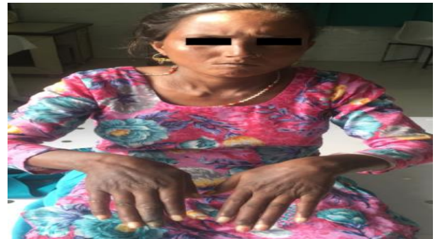
Figure 10: scleroderma seen on right middle finger.