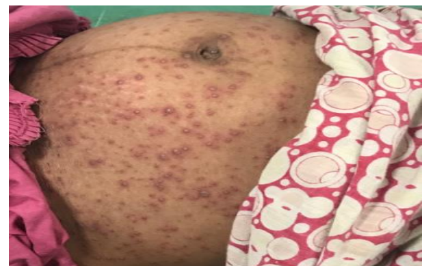
Figure 12: Chicken pox in pregnancy