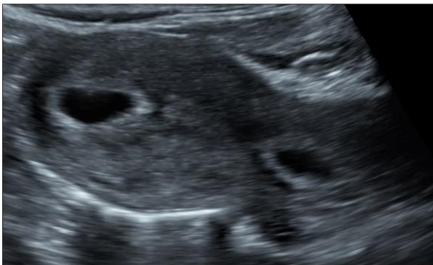
Figure 1: Trans-abdominal image.

A 47-year-old ART treated Elderly primi-gravida was referred from an Infertility clinic as a suspected case of heterotopic cervical pregnancy at 6 weeks 1 day with history of vaginal bleeding of 1-day duration. She was married for 3 years. She was a pre-gestational diabetic on insulin and chronic hypertensive on regular anti-hypertensive medications. History of both male and female factor infertility noted. Multiple failed attempts of ovulation inductions, 3 failed Intrauterine inseminations and 1 failed IVF. Hence, she underwent ICSI conception with own gametes and 3 embryos transferred in blastocyst stage on Day 5 (17/2/2018). Pregnancy confirmed by Beta HCG on Day 14 (2/3/2018). She was on luteal phase supports with vaginal Progesterone. Early pregnancy scan done in IVF clinic (outside) on Day 25 (13/3/2018) showed two gestational sacs: one intrauterine and another cervical sac: possibility of a CHP. She was advised to review after a week to confirm the diagnosis. Three days later she had vaginal bleeding with which she was referred to our emergency room at 6 weeks 1 day (16/3/2018).