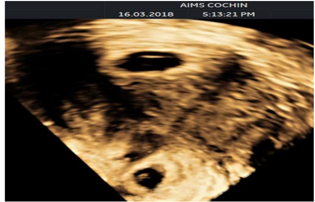
Figure 2: Transvaginal image.

On examination, she was hemodynamically stable, obese and short statured woman. On per speculum examination, cervix appeared ballooned out with a trickle of blood from the external os. Immediate transabdominal and transvaginal sonography showed a live intrauterine embryo with CRL=6.2mm (HR=122 bpm), cervical embryo with CRL=2.6mm (HR=106 bpm) (Figure 1 and 2). Transvaginal color Doppler scan was performed to demonstrate peri trophoblastic flow in the cervical sac. A confirmed diagnosis of cervical heterotopic pregnancy (CHP) with a live intrauterine sac and a live cervical sac was made. In view of her high-risk factors like advanced maternal age, multiple failed attempts for pregnancy, diabetes and hypertensive status, she was counselled for surgical method of management so as to arrest the bleeding and save the intrauterine pregnancy.