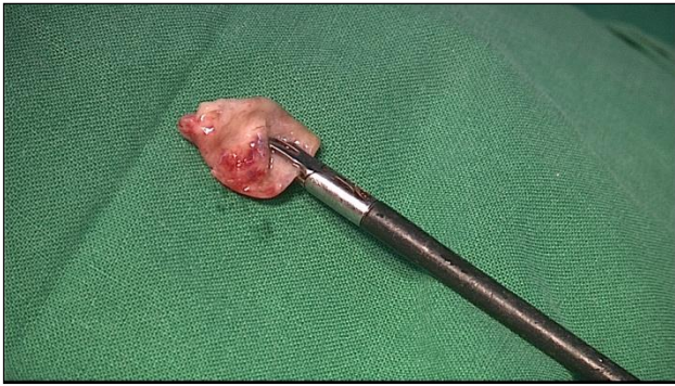
Figure 6: The products of conception removed via laparoscopic grasper.

The postoperative course was uneventful. She was discharged the same day. A repeat ultrasonography done 2 weeks later did not reveal any retained products of conception.