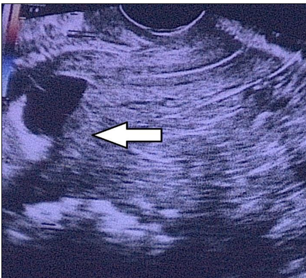
Figure 2: Ultrasonography done after 1st dose of methotrexate, showing the increased diameter of the gestational sac.