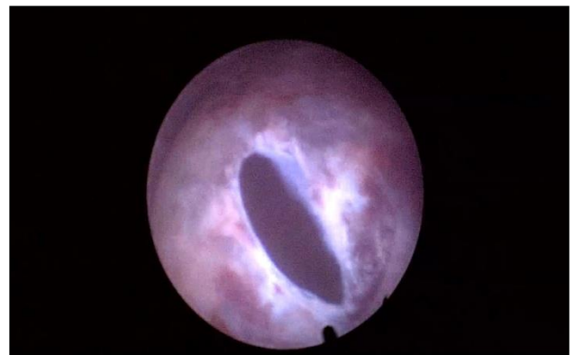
Figure 4: Illustrating the nick given on the gestational sac with scissors.

On day 40, patient presented with bleeding per vaginum, soaking 2 pads. She was posted for a hysteroscopic removal of products of conception. On hysteroscopy, a gestational sac was noted at the site of the previous cesarean scar (Figure 3). A nick was made on the gestational sac to collapse the wall (Figure 4). The sac was then separated from the myometrium using scissors. The products were removed with the help of a 5mm laparoscopic grasper by passing it by the side of the outer sheath of the hysteroscope (Figure 5, 6).