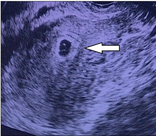
Figure 1: Ultrasonography suggestive of a scar ectopic pregnancy, arrow depicting the gestational sac.

The dose of methotrexate given was 1mg/kg on day 1, administered intramuscularly. Repeat beta HCG value on day 3 was 7529 and gestational sac size had increased by 2mm, a second dose of methotrexate was then administered (Figure 2). The third dose (day 5) of methotrexate was delayed due to elevated liver enzymes. One week later on day 12, when repeat liver function was normal, third dose of methotrexate was given at a beta HCG value of 3095. Beta HCG values repeated subsequently were 1881 on day 22 and 78 on day 37.