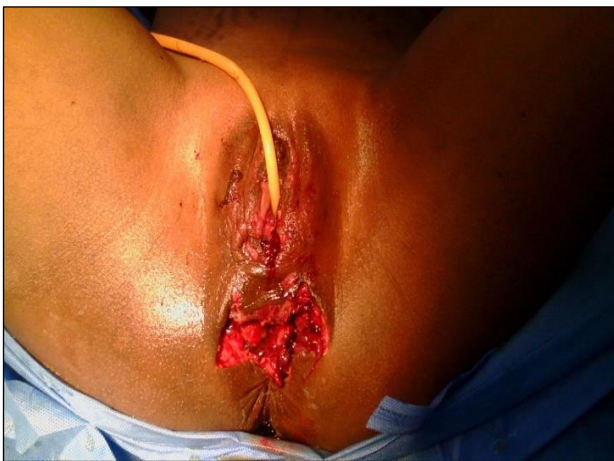
Figure 1: Central rupture of perineum with intact introitus.

On local examination Introitus was intact. A vaginal mucosal tear approximately 2x4 cm was present 3 cm above the Introitus and was communicating with 4x6 cm perineal tear. The perineal tear was involving anterior fibres of anal sphincter and distal 2cms of anterior wall of rectal mucosa (Figure 1).