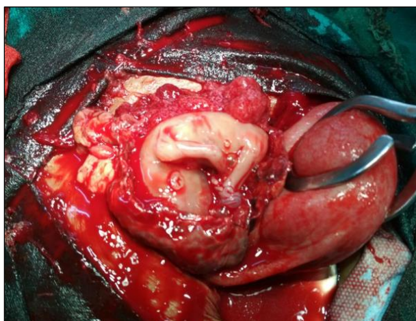
Figure 1: Fetus lying in ruptured ovarian mass, along with normal left tube.

Hardly, any ovarian tissue was visible at base and the large primary ovarian ectopic was adherent near hilum. Therefore, the decision for right salpingoophorectomy was taken. On histopathology, the diagnosis of ovarian ectopic was confirmed. The post-operative period was uneventful and was discharged without any complications. Follow up with \beta hcg was done, which came down to normal within 2 weeks.