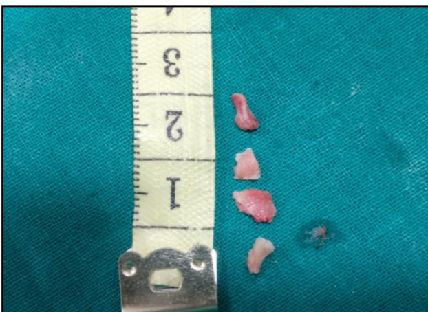
Figure 3: Naked view of bone fragments removed hysteroscopically.

Fetal Bones were removed hysteroscopically at the same sitting. Figure 3 shows naked view appearance of fetal bones, which were removed hysteroscopically. Laparoscopy showed normal uterus, ovaries and fallopian tubes with normal patency. Post-operative period was uneventful. Patient was discharged on tab Premarin for 3 months. On follow up evaluation after 2 months, TVS showed normal endometrial thickness, no retained fetal bones and no adhesions. Patient now has normal cycles and is undergoing treatment for infertility.