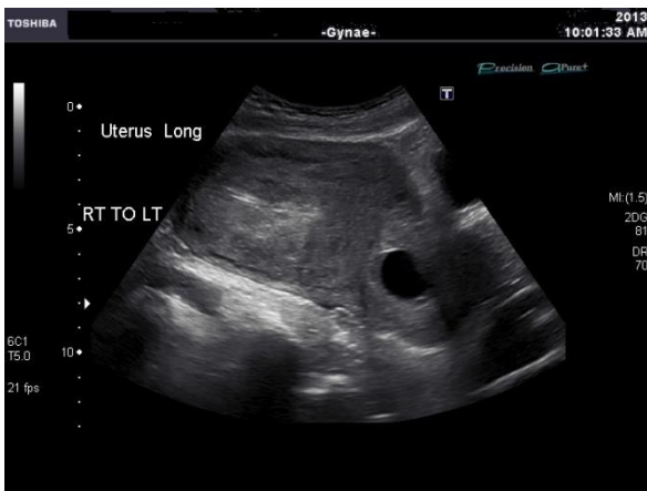
Figure 1: Ultrasonography of the long axis of uterus showing enlarged uterine cavity in the lower segment.

On examination, she was conscious, oriented and speaking in full sentences. Her blood pressure was 106/60 mm Hg, pulse 102 beats per minute and saturation 100% at room air. Abdominal examination showed mild tenderness in the suprapubic region. On per speculum, 300 ml of clots were evacuated. Cervical os was noted to be open but with minimal active bleeding. Bimanual examination showed a uterus which was well contracted. Her investigations revealed a haemoglobin of 14.2 g/dl and normal coagulation profile. Real time ultrasound in the emergency department revealed an empty uterus with no retained products; however a formal ultrasound in the radiology department showed an ovoid 19mm X 23mm anechoic space containing arterialised flow, appearances of which was consistent with an arteriovenous malformation. The scan also confirmed no retained products of conception.