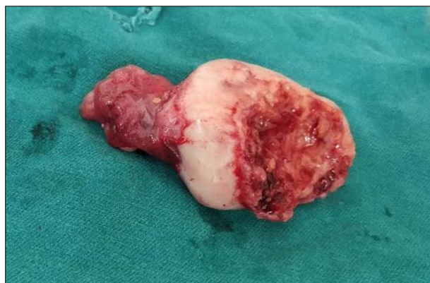
Figure 2: Rt. ovary inside view of ruptured cyst with right fallopian tube.

On general examination, her height was 161 cm and weight were 52 kg. Her vital parameters were normal. Moderate Pallor was detected. No clinically detectable abnormality was found in respiratory, cardio vascular and central nervous system. Abdomen showed a healthy sub-umbilical midline vertical scar. There was no abdominal distension. No mass was found on palpation. On per speculum examination no abnormality was detected.