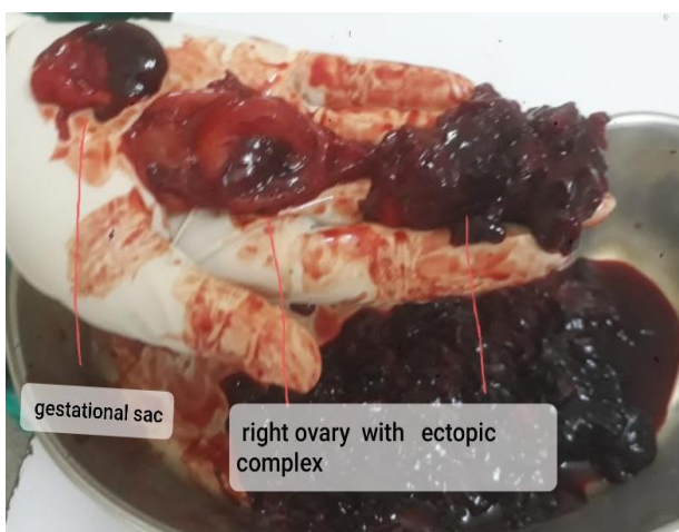
Figure 2: Ruptured gestational sac and complex mass consisted of extensive adhesion between right ovary and ectopic complex.

Her CA-125 was 119.30 IU/l, in view of above finding computed tomography (CT) pelvis and abdomen was done, which revealed a tubo-ovarian mass of size 10×8 cm in right adnexa, suggestive of chronic ectopic pregnancy. Meanwhile UPT became negative on 5th day of hospital stay and got 5 unit of blood of a positive during her hospital stay prior to surgery. In view of above finding underwent an exploratory laparotomy group A positive, and there was evidence of chronic inflammation with mild small bowel adhesion and a cystic mass lesion in right fallopian tube, along with right ovary formed a complex mass which was densely adhered to the posterior surface of uterus. Because of extensive adhesions, the entire complex with the right tube and ovary were removed by right salpingo-oophorectomy (Figure 2).