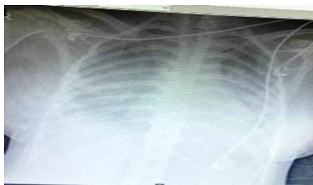
Figure 1: Pleural effusion.

Blood tests were repeated the following day after caesarean section showed falling platelet levels of 60,000/mm 3 and ALT/AST 382 U/l and 337 U/l, lactate dehydrogenase (LDH) of 1448; characteristic of HELLP syndrome.