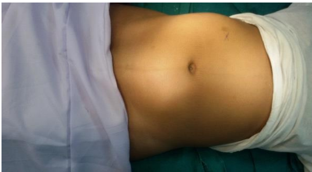
Figure 1: Per abdominal inspection revealing abnormal uterine contour and foetal heart sound marked with cross on right hypochondrial region.

contour was not appreciable. Foetal parts were felt more easily than usual. Foetal heart sound was heard on left side of upper half of abdomen. Per vaginal examination revealed an uneffaced, undilated firm cervix. No bleeding per vaginum. Magnetic Resonance Imaging of abdomen and pelvis (Figure 2) revealed extra uterine pregnancy in abdominal cavity and placenta was situated in left iliac fossa and suprapubic region and abutting mesentery and fundus of uterus. Prominent blood vessels in the parauterine region. Both ovaries were not separately identified. Prominent vessel also seen extending superiorly along left psoas muscle to reach up to splenic and renal vessels from which it appears non separable.