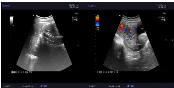
Figure 2: MRI of abdomen and pelvis: Extra uterine pregnancy in abdominal cavity and placenta is situated in left iliac fossa and suprapubic region and abutting mesentery and fundus of uterus. Prominent blood vessels in the parauterine region present. Both ovaries were not separately identified. Prominent vessel also seen extending superiorly along left psoas muscle to reach up to splenic and renal vessels from which it appears non separable.

With informed high risk and written consent, three units of packed cells arranged and general surgeon by side patient was taken for exploratory laparotomy (Figure 3) under spinal anaesthesia. Abdomen was opened up by midline subumbilical incision. Foetus was lying in abdominal cavity on the right side; an alive female child weighing 2.5 kg was delivered out. Placenta was in left lower abdomen involving omentum, small bowel, mesentery and sigmoid colon. Uterus and right adnexa