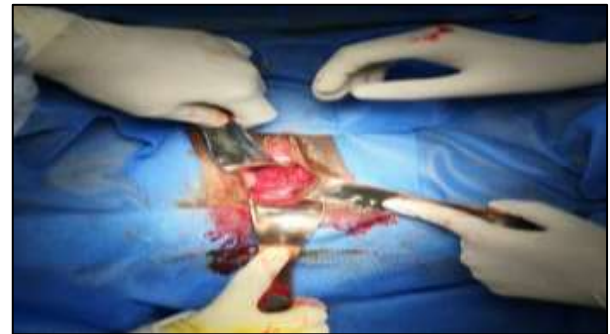
Figure 4: Cerclage insitu with the reformed cervix.

cervical incompetence with ballooning of membranes. She was advised termination of the pregnancy as fetal salvagability was difficult in view of advanced cervical dilatation. As she had a history of prolonged infertility following her 1st pregnancy and had only 1 live child, she was very much desirous of continuing this pregnancy and hence approached us on the same day.