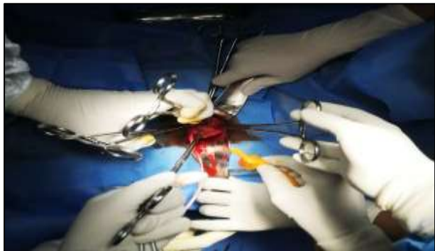
Figure 2: Foley's bulb inflated with 15ml saline was used to push the bag of membranes inside to proceed with the cerclage.