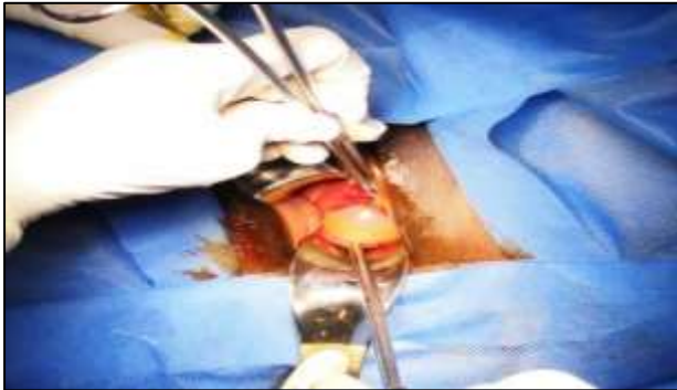
Figure 1: Bulging membranes through a well-effaced cervix.

or heaviness of lower abdomen. 15 years back she had a normal vaginal delivery and the baby had expired at 1 year. 2 years back she had undergone an emergency C-section for fetal distress.