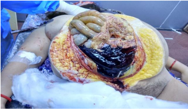
Figure 1: Abdominal cavity showing blood clot.