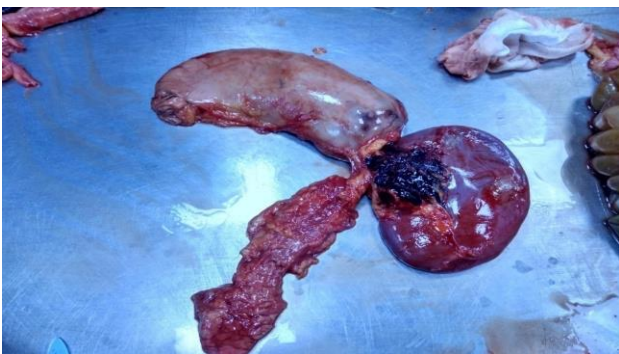
Figure 3: Spleen, stomach, pancreas and blood clot and ruptured splenic artery aneurysm at splenic hilum.