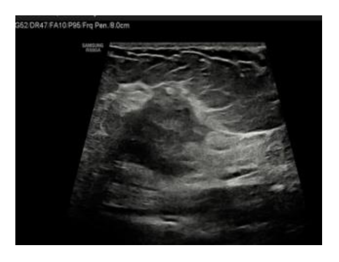
Figure 1: USG endometriosis.

radiology plan and there was no need for MRI. After detail discussion we planned for laparoscopy (to rule pelvic deposits) dilatation curettage and Mirena coil insertion after surgical excision of endometriosis on scar and Mesh repair, same was performed under General Anaesthesia and later TA (transverse abdominis plane) block given. Patient stood procedure well.